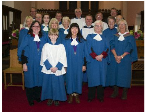
Christ Church Choir - a happy & competent group of singers

Parish Communion (CW), occasional Sunday Evening Services & Festivals, Funerals (if available) and weddings. Weekly choir practice