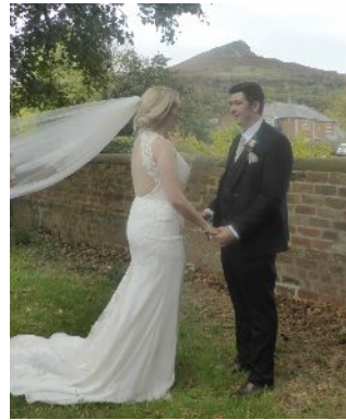
Our own bespoke view of Roseberry Topping