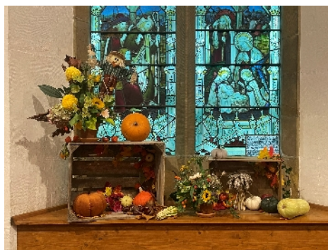
Harvest Flowers celebrate God's goodness