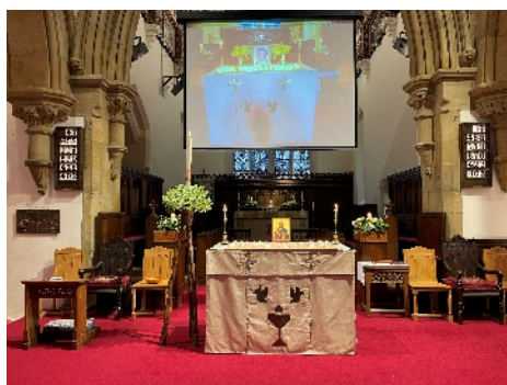
The bi Annual Memorial Services have always been well attended and appreciated.