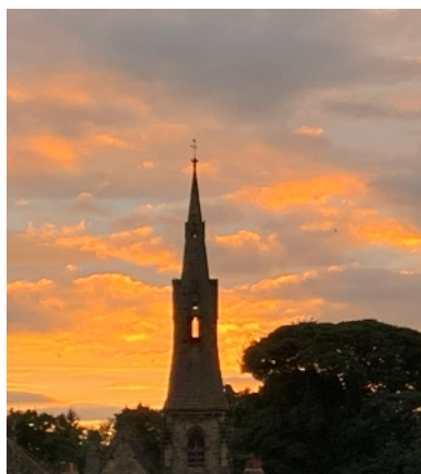
A Slender Spire as the sun sets