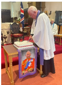
A Cake fit for a King