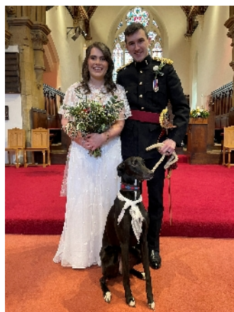
And the dog came too