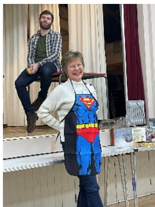
Charity Auction Superwoman