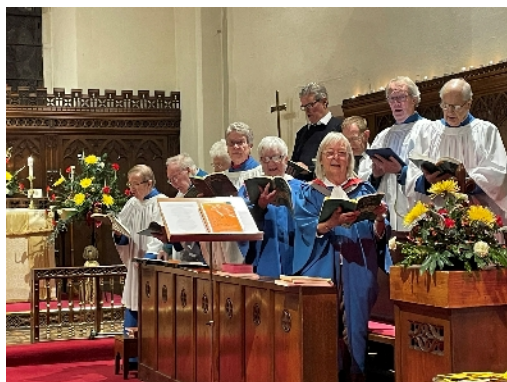
Some of the Christmas Choir praising God