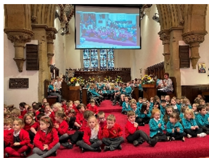
Pews packed tight with over 500+ for the schools Carol Service.