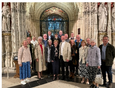
Supporting the new Honorary Canon of York Minster