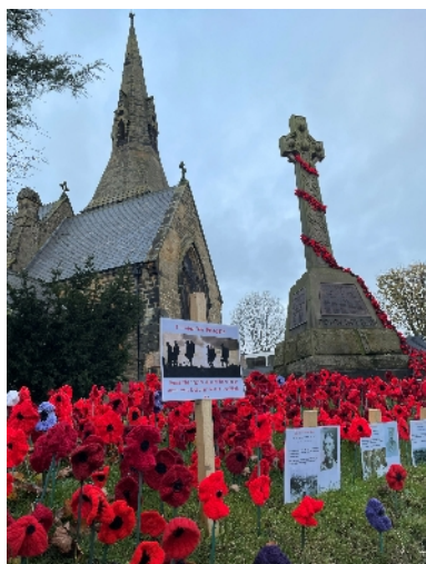
We will Remember Them