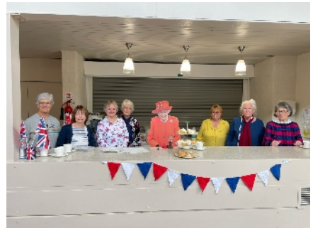
We had a party in the Coffee Lounge for our Monday Communion Folk and enjoyed a royal visit too.