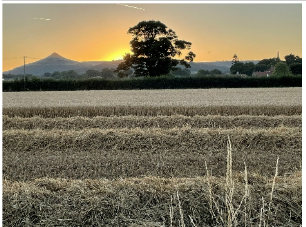
All is being gathered in. Our Harvest Service will be on Sunday October 9th. Have you any Harvest scenes for October Spire?