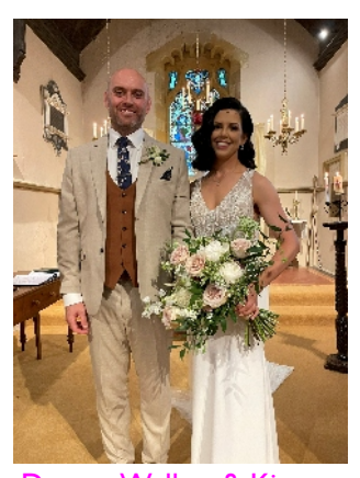
West married 15 July.