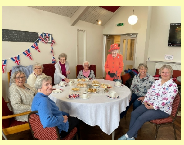
Some of the gang at the jubilee party