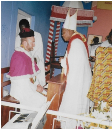
Being installed as Canon of Ho in 2005. Ho Diocese was 20 years old in August.

Clergy are installed into certain stalls in the Minster, that represent ancient Parishes that used to provide a living for them. At one time they were expected to help with the day to day worship in the Minster, but if they couldn't get there to do that, as they still had to work in their own Parishes, then they appointed Vicar Chorals to do the job for them of singing the offices each day. I am to be made Canon and Prebend of Husthwaite, an ancient village just off the A19.