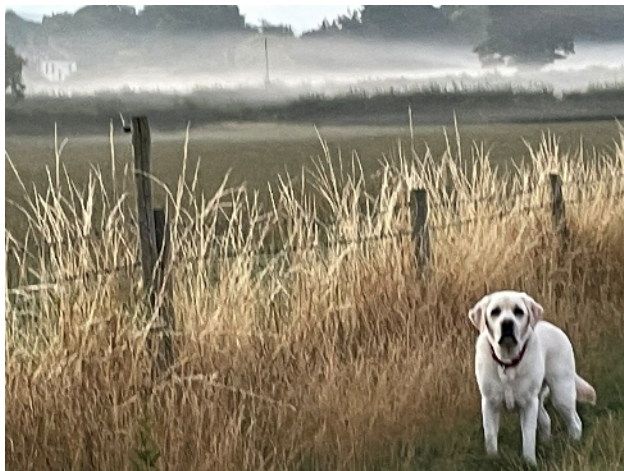
Autumn Mornings & Evenings in Great Ayton