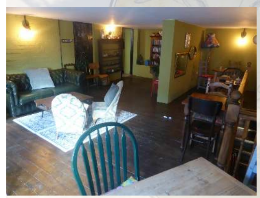
Don't forget to check out upstairs. It will look great with a Christmas tree.

You can either sit in the window and watch the world go by, or if you prefer a cosy hideaway look to the former storeroom up the stairs at the back. A log burner in the corner promises to make this a cosy place on a winter's day.