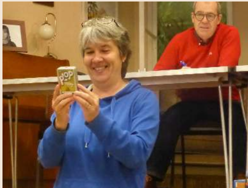
Auctioning the game "Plop"

Christ Church Hall, Guisborough Road, Great Ayton.