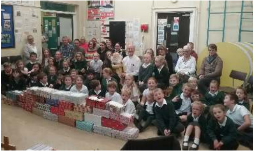
Always a delight to take assembly at Ingleby Greenhow school each year.

Once again we had good support from local schools, Churches, the Royal Oak and a Health Centre in Billingham! By the time you read this they will be on their way.