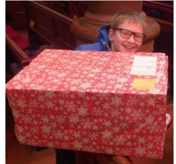
Surely this counts more than 1