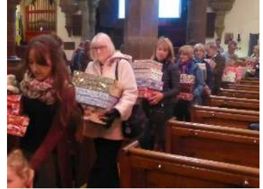
We carried all the boxes out