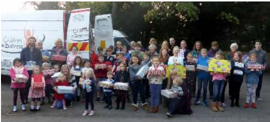
Loading the van outside Christ Church