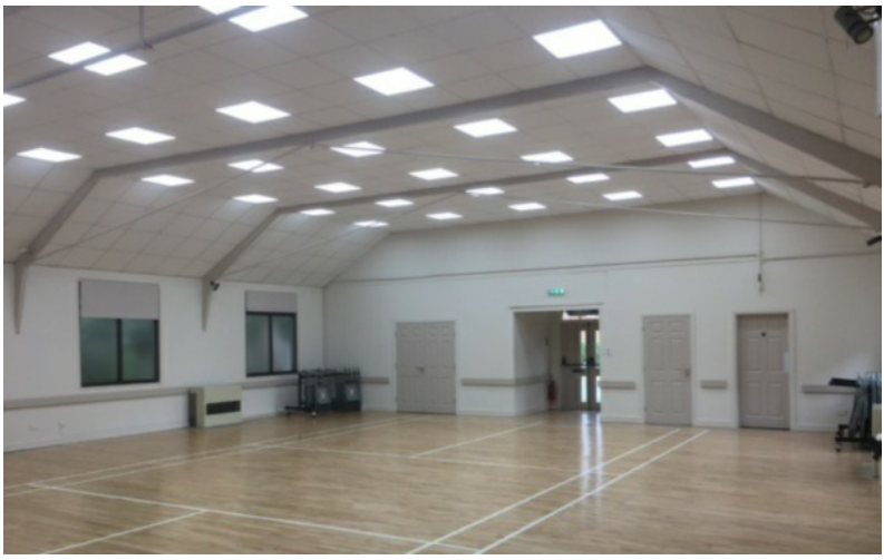
The newly renovated Church Hall