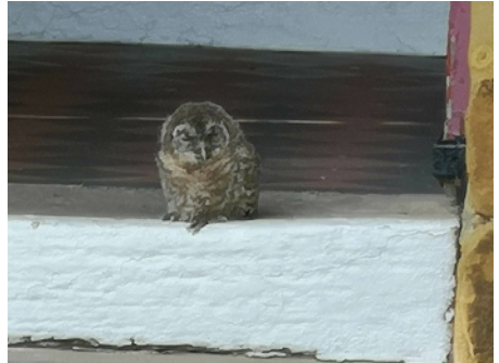
Can I come to Church?

Once Plop had made it into the trees, then his smaller sibling, Plip, came down, much to the surprise of the Drama Tea Ladies who spotted him as they left the Church Hall. Again, a couple of days later and it too was high in a tree.