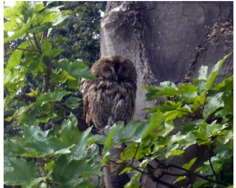
Parent owl keeping watch