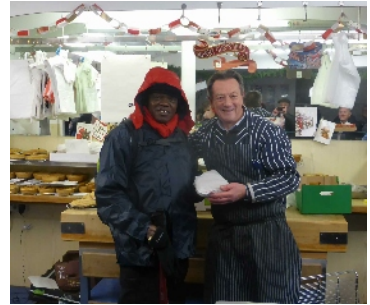
Even Archbishops like Petch's Pies!