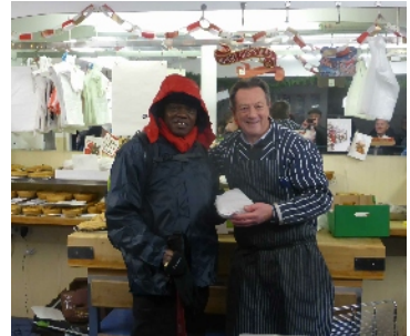
Even Archbishops like Petch's Pies!