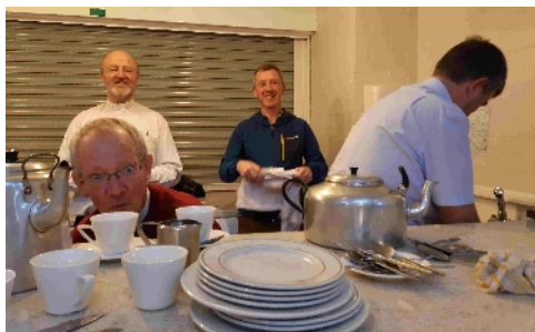
A new venture was a Harvest Sung Evensong & Faith Tea. We had 39 folk turn up for the 4 th service of the day. Surprise was expressed that the men did the washing up - well there was no BBQ to take charge of!