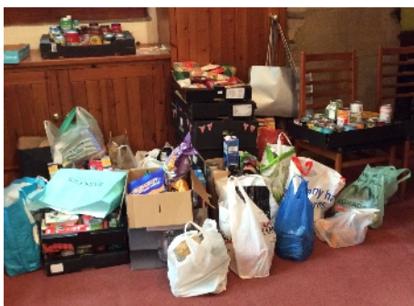
Harvest Gifts awaiting collection for Middlesbrough Foodbank. Thank you to all who kindly donated goods and money.

Our Young people learn many life skills from Scouting, and now our Scout Troop is open to boys and girls and Leaders are not restricted to Males either. As with any organisation, DBS checks, references and interviews would be required for Safeguarding purposes. Contact the Scouts if you are interested.