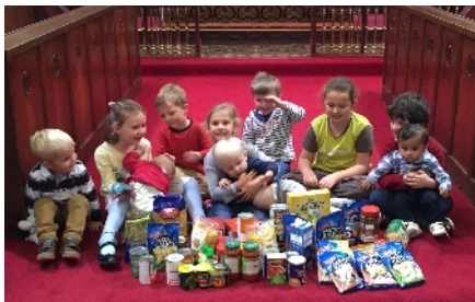
Some of the children from the Come & Praise with their gifts.