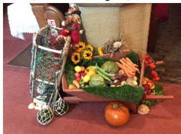
Fantastic flowers in Christ Church. Thank you to our talented flower ladies.