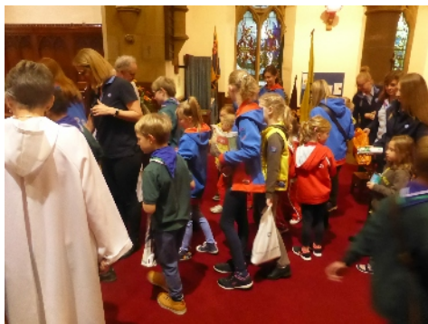
The Young people were asked to bring gifts for Middlesbrough Foodbank

We had a good attendance at Harvest from Rainbows, Brownies, Guides, Beavers and Cubs but unfortunately the Scouts couldn't be there as they are down to one Leader who was working that day. A recent article said that Nationally the waiting list to join Scouts is over 50,000 people, but they are desperately short of volunteers to lead. We are experiencing problems now in our village and if Scouts are to continue, they do need more help. Could it be you?