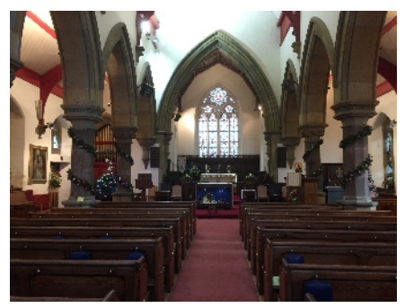
At Great Ayton a beautifully decorated Church and well equipped Church Hall standing empty most of Christmas & New Year.