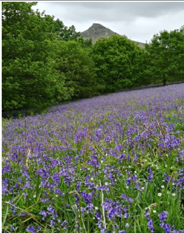
In case you don't get to see the Blue Bells