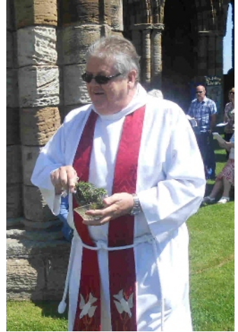
In the sunshine at Whitby Abbey for the Archdeaconry Pilgrimage

He has served on the Archbishop's Council, the Diocesan Parsonages Board, the Diocesan Synod and is also Diocesan Chaplain to the Mother's Union.