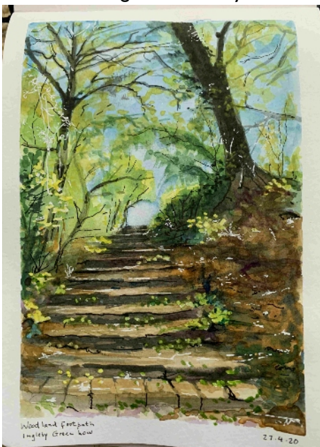
Woodland path Ingleby Greenhow