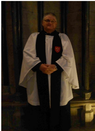
Installation as Canon of Wetwang in York Minster 2013