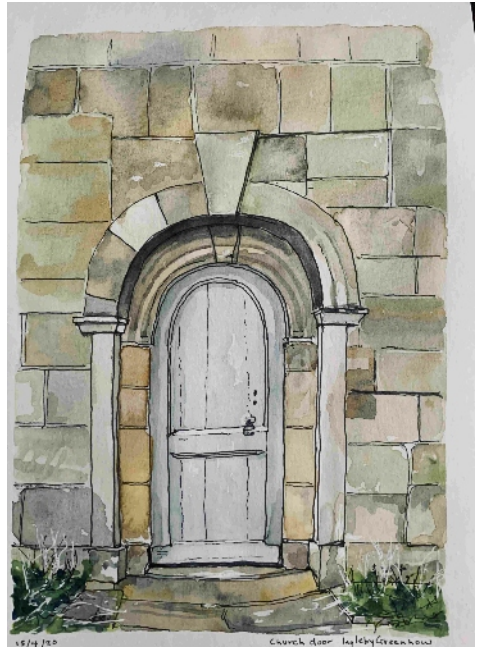
Church door Ingleby Greenhow