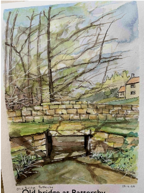
Old bridge Battersby

featuring local scenes. How did you use your time?