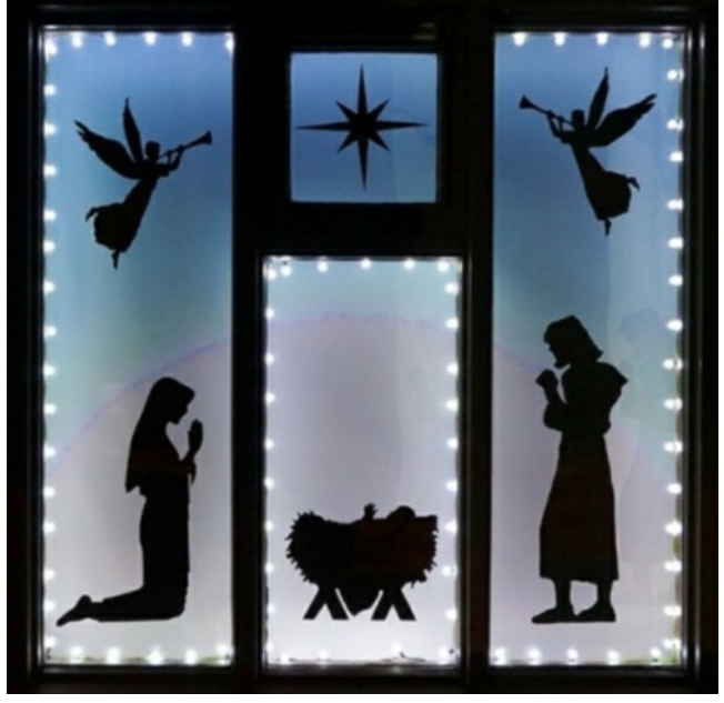
Watch Out for the Advent Windows around the village. Revealed daily on Facebook

Community Carols from your Doorstep Monday 21st December at 6.30pm (Replaces Carols on High Green this year) Will be streamed on YouTube